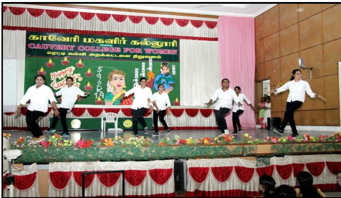
Teacher's Day celebrations, honoring faculty with gifts and recognition, and organizing cultural activities at O.P. Ramaswamy Reddiyar Auditorium on 05.09.2019